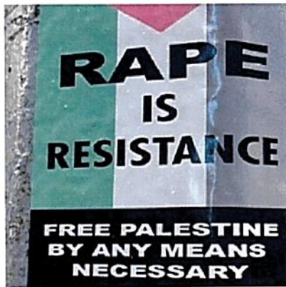
Sticker found in Toronto, 2024

Pro-jihad protesters use signs and slogans of “By any means necessary” and “Rape is resistance”, as well as other threatening language. Video footage of multiple instances is readily available online.