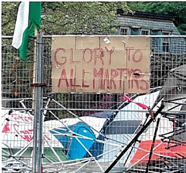
University of Toronto Encampments, 2024

One student was targeted at the TMU and threatened with rape and death and told she “should have been aborted”. She had to continue her studies from home for fear of her safety.