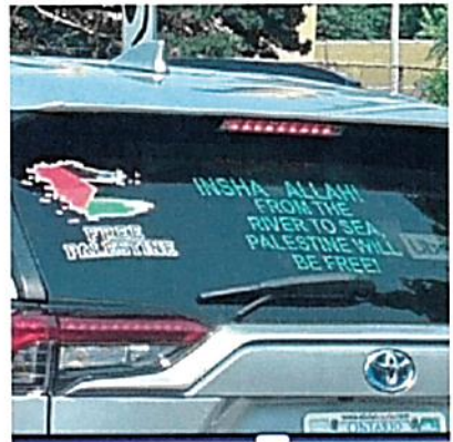
Uber in Toronto, 2024