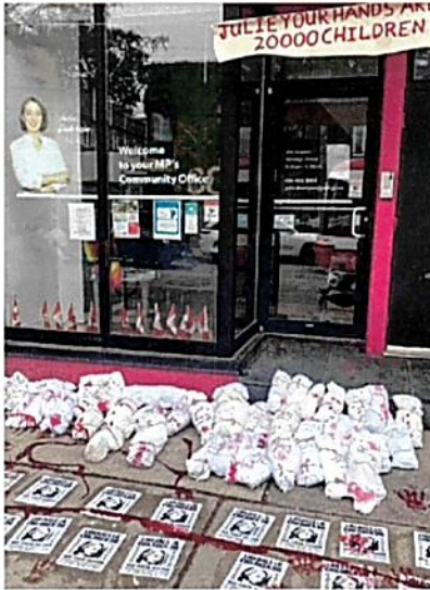
Vandalism at a Jewish MP's office