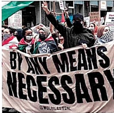
Toronto Protest, 2024