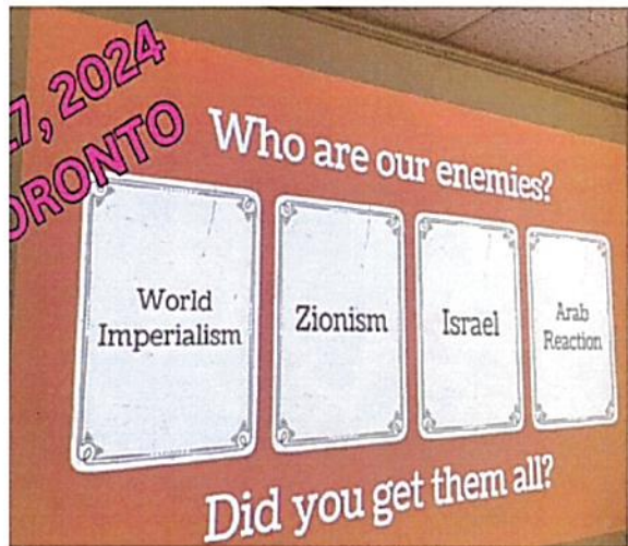
Screenshot from a Samidoun class taught in Toronto July 17th, 2024