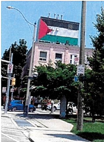
Palestinian Flag painted on the building at 53 Strachan Avenue, Toronto

Multiple Jewish community buildings, private businesses and property recognized or assumed to be owned by Israelis or Jews have been threatened and/or vandalized in the last 10 months, often repeatedly. Jewish day schools have been shot at or set on fire. Synagogues have been vandalized. A Jewish-owned school bus was set on fire. While there has been an increased police presence at some establishments, it is our view that a strong response will deter further instances, as opposed to the response provided by our Mayor suggesting that Jewish buildings install “bullet-proof windows”.