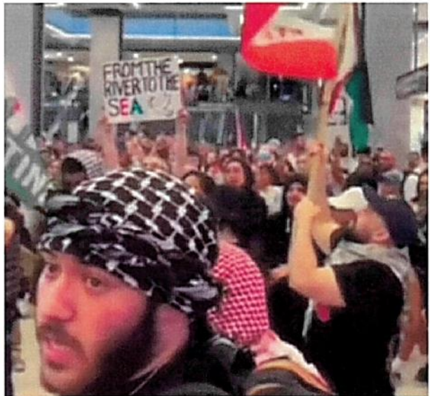
Union Station, May 31, 2024